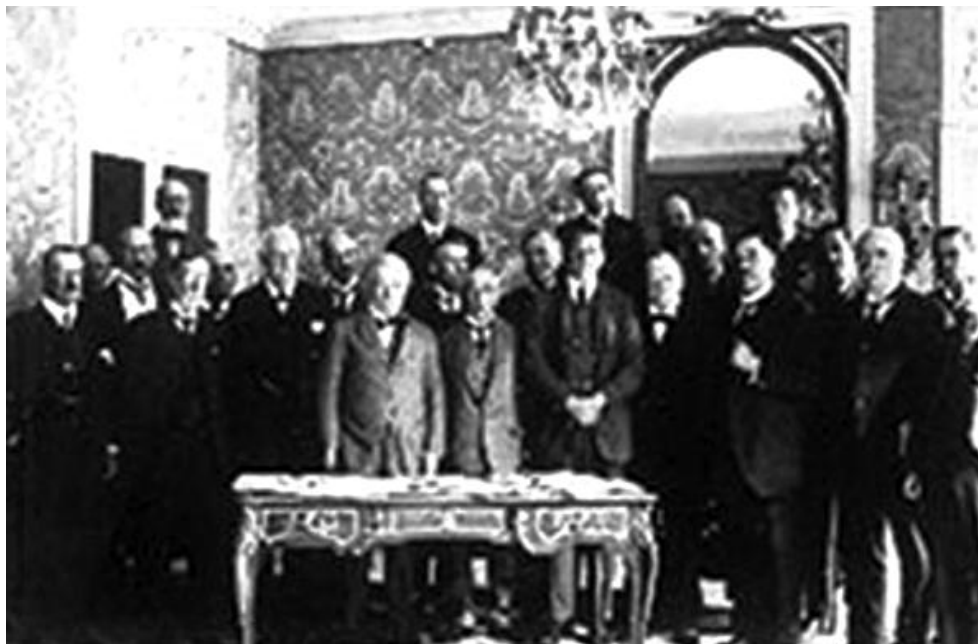
Participants of the Treaty of Sevres