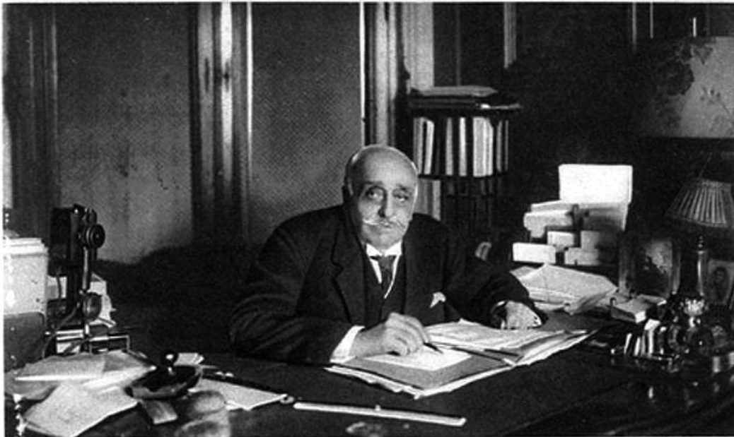
ԽՅՂՈՍ ՆՈՒՊԱՐ ՓԱՇԱ ԱԳԱՅԻՆ ԲԱՐԵՐԱՐ ԵՒ ՀԻՄՆԱԴԻՐ Հ. Բ. Շ. ՍԻՈՒԹԵԱՆ