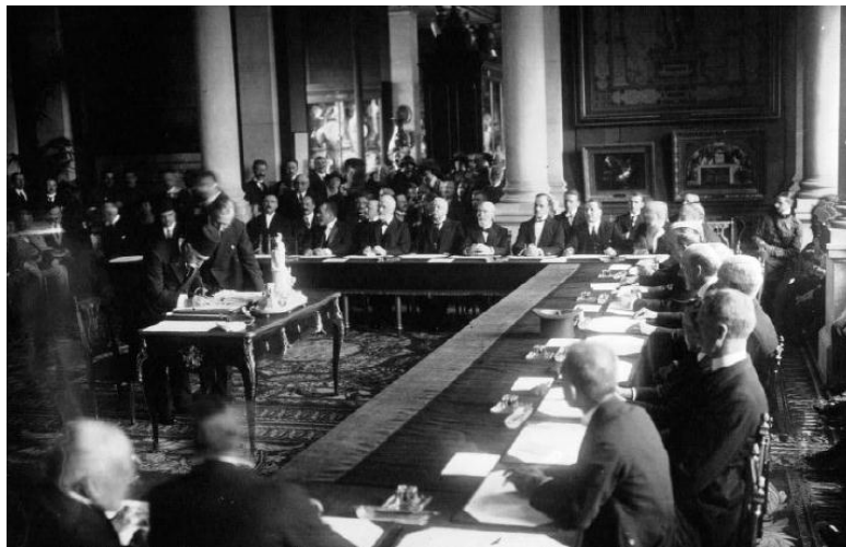
The Turkish delegation put his signature under the Treaty of Sevres